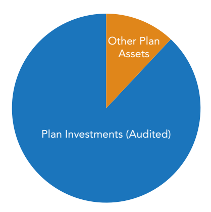
Full Scope Audit